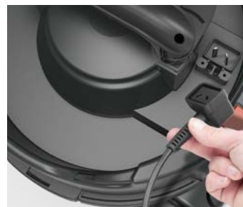
Easy Cable Replacement