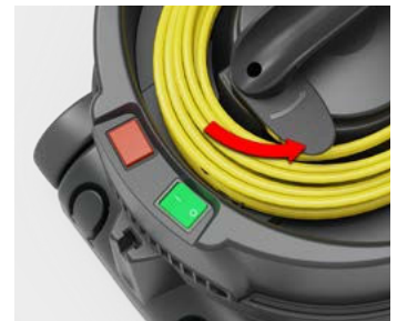
On-board Cable Storage