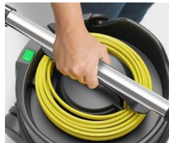
Convenient Carry Handle