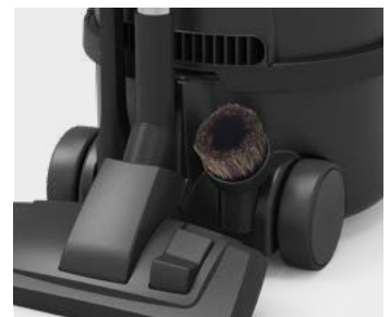
On-board Tool Storage